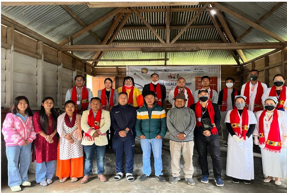
Photograph of the mega health camp conducted from 21 st march 2023 to 31 st march 2023 in the state of Dawn-lit Mountain, Arunachal Pradesh.