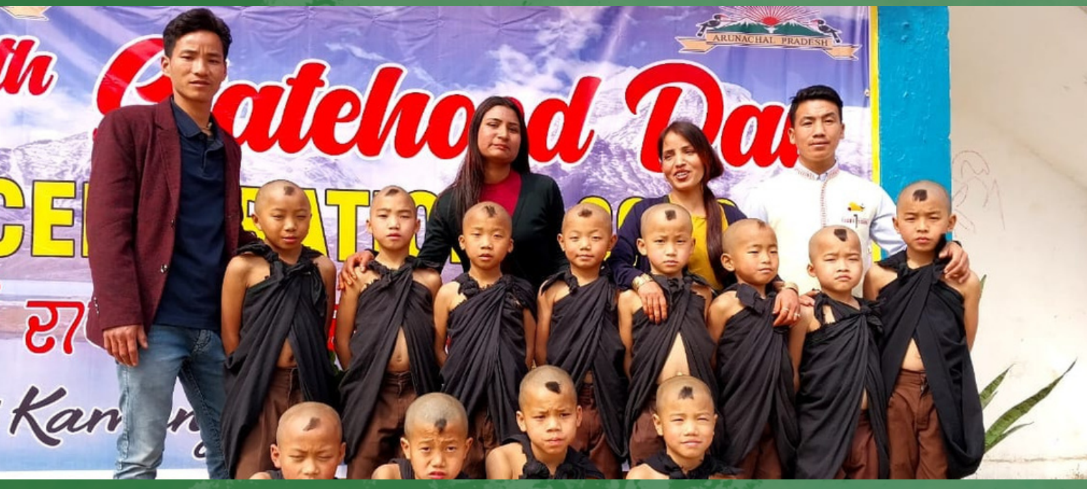
The students of Nyubu Nyvgam Yerko, Rang secured the Second Prize in the Cultural Event organized by DACO, East Kameng, Seppa during the 37th Statehood Day celebrations at Seppa General Ground on 20th February 2023.

On December 17th, 2021, a momentous occasion unfolded as the Nyedar Namlo at Mwya (Pulyi) village was inaugurated by the esteemed Chief Minister of Arunachal Pradesh, Shri Pema Khandu. The inauguration ceremony witnessed a captivating display of cultural heritage as the students of Nyubu Nyvgam Yerko from Rang showcased the rich cultural practices of the state. Their performance resonated with the dignitaries present, further emphasizing the significance and beauty of Arunachal Pradesh's cultural heritage.